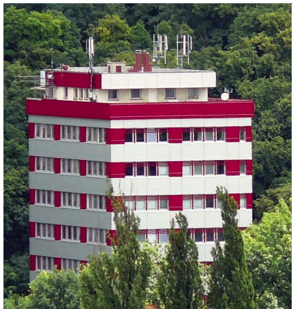
Headquarters of the Union of Czech and Moravian Housing Co-operatives (UCMHC)

The UCMHC is governed by its own Statutes adopted at the annual General Assembly of housing cooperatives attended by delegates from the individual regions. In the regions, the co-operatives meet at their conferences and meetings with the housing co-operative workers and officials to address common problems.