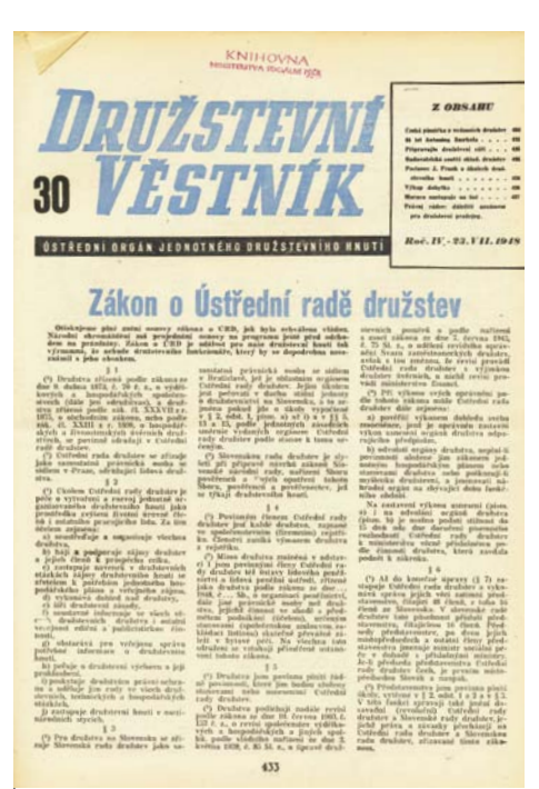
Central Council of Co-operatives Act

The first meeting of the Central Council of Co-operatives, which took place on 17 May 1945, was attended by the representatives of all the existing unions, i. e. the Union of Consumer Cooperatives, the Union of Agricultural Cooperatives, the General Union (umbrella organisation of the production, labour and trade co-operatives) and the Union of Housing Companies. All co-operative