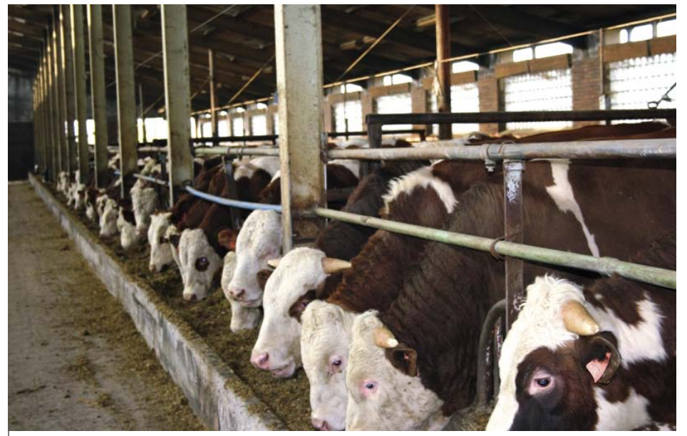
Bull breeding in Velké Pavlovice

There are two aspects that we have to follow. One, which relates to the everyday necessary work, and the other in the form of identification