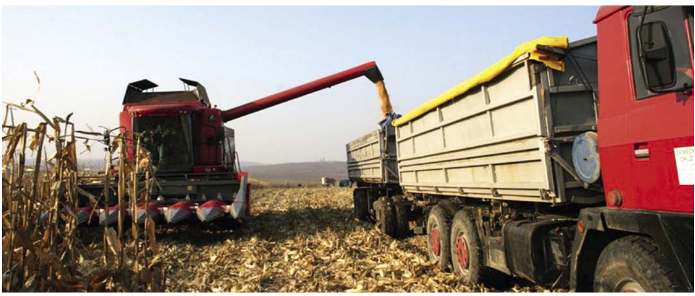
Harvest of grain maize in Velké Pavlovice

failure regarding the potential possibility of repayment of their claim, because after such sale, payment of rewards to the receiver in bankruptcy and similar payments, a very small part remains for the creditors, often even below 10 percent of their submitted original claim. After such intervention of the bankruptcy administrator, there is usually no chance for the company to continue its business and the employees are dismissed. Act No. 182/2006 Coll., the Insolvency Act, in its Section 316 on reorganisation stipulates that reorganisation usually means a gradual satisfaction of the claims of creditors while preserving the business operation of the enterprise based on the reorganisation plan approved by the insolvency court with continuous control of its implementation by the creditors.