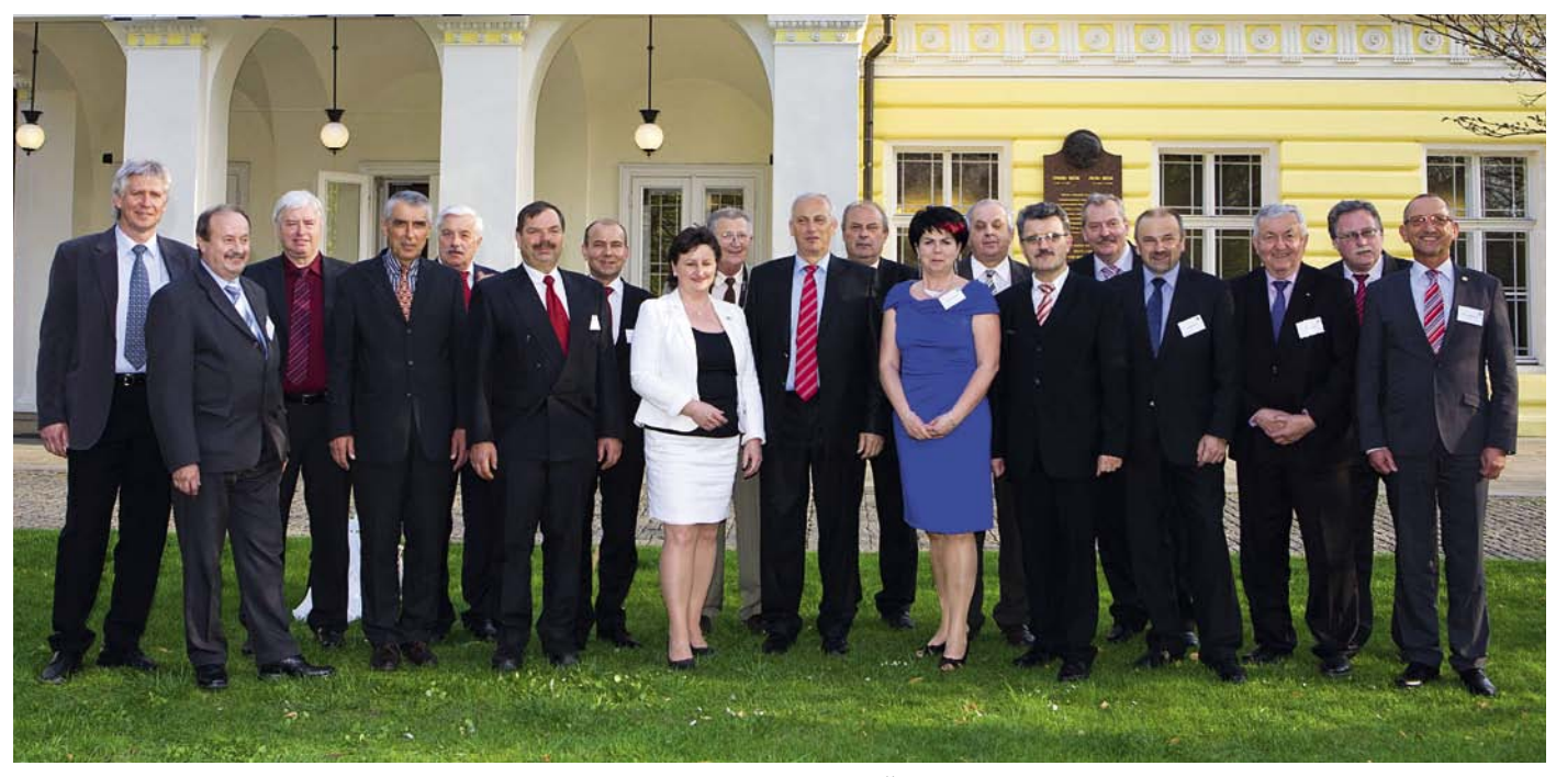
Successful managers nominated by the AACR for the last 10 years before the Žofin Palace, where the results of the competition are traditionally announced, this time with the participation of the President of the Czech Republic

which is a task for the professional organisations. Anyway, we can say with some exaggeration that the evaluated managers are sometimes not fully aware of their roles, which include, in particular: