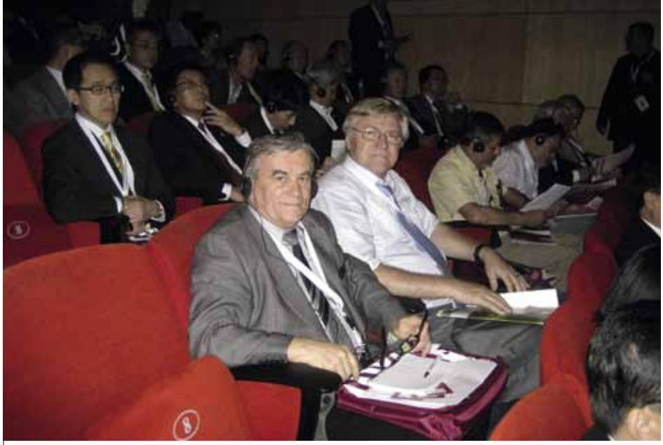
General Assembly of the ICA – Czech delegation

The three workshops of the Global Conference on the Co-operative Decade subsequently resumed their programmes from the previous day (more information follows below).