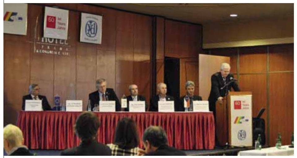
UCMPC national consultation meeting - Prime Minister's speech

Another major event was the national consultation meeting of production co-operatives held on 15 November in Prague attended by 200 representatives of member co-operatives. The main theme of the speech of the UCMPC President JUDr. Rostislav Dvořák was the project of restructuring the economy of the Czech Republic to strengthen the stabilisation of economy and employment through co-operative production enterprises and medium--sized companies. A guest of honour at the national consultation meeting was the Czech Prime Minister Jiří Rusnok.